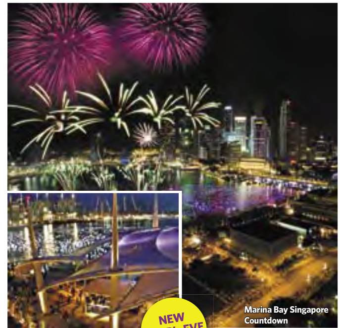
Marina Bay Singapore Countdown

For prime views of this extravaganza, and of course, the rip-roaring fireworks thereafter book into one of the numerous 5-star hotel in the vicinity. www.marinabaycountdownparty.com