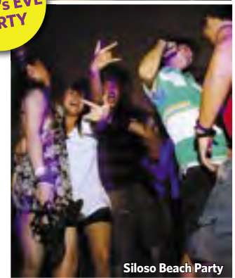
Siloso Beach Party