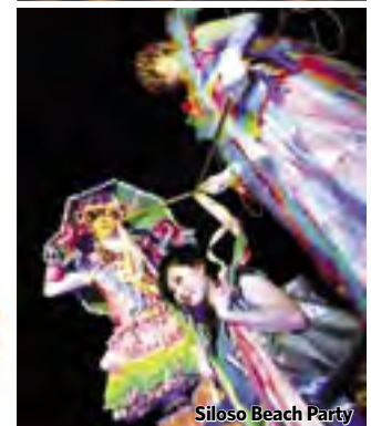
Siloso Beach Party