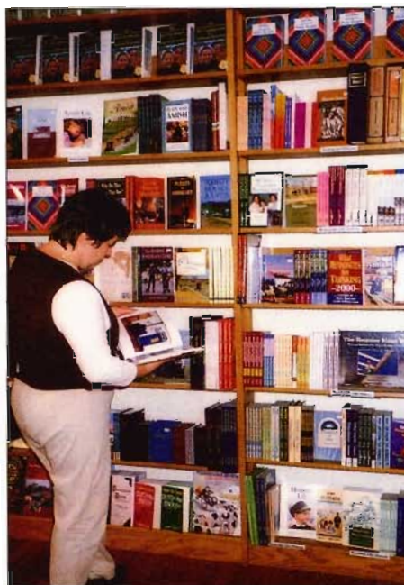
The People's Place, located in the center of the village of Intercourse, Lancaster County, features a large bookshop filled with a variety of titles examining Amish and Mennonite life.

your fill of the sights, sounds and colors of the discovery museum, head across the street to the People's Place Quilt Museum. Here, the lessons about the Plain community are subtler, told in shades of color and pattern