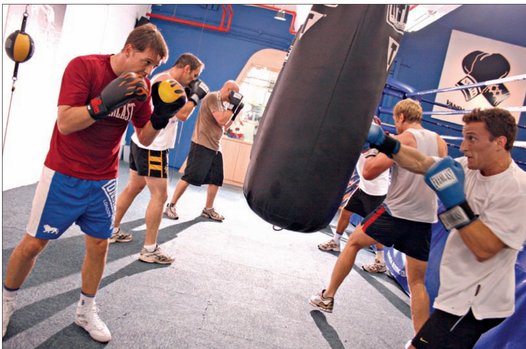
Fists of fury Hard-hitting blokes at Vanda Boxing Club show those bags who's boss

But watching the event from a cushy chair, dressed in black tie and nibbling 'great food and drink' is a world away from actually entering the ring. That's